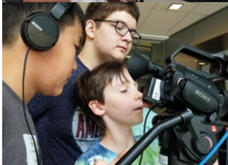
FILM & VIDEO